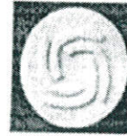
Grey Seal with Logo